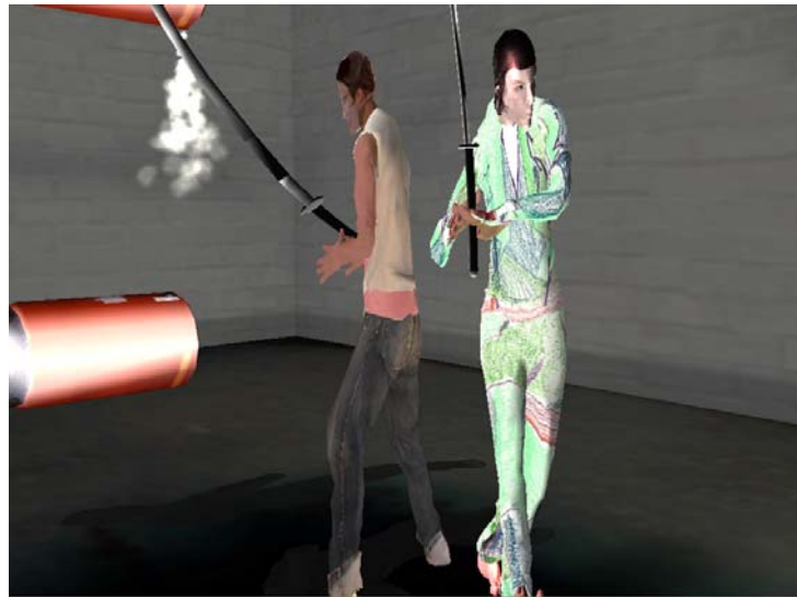
CAMERA DOLLY OUT - HERE WE NEED TO INSERT A WAIT ANIMATION FOR SHARICE AND WYNN